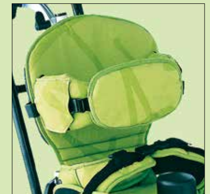
7. Optional chest harness