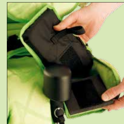
2. Ramped base cushion