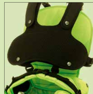
8. Trunk harness