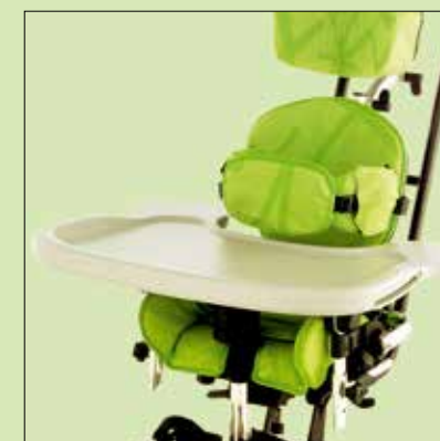
14. Activity tray