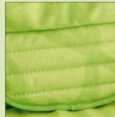
1. Flexible lumbar and sacral cushion